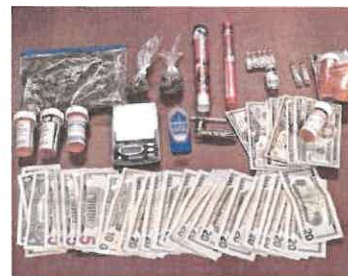
Items seized from Tuesday's arrest of two Cedar Grove men.