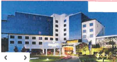
Sheraton Tirana... Tirana